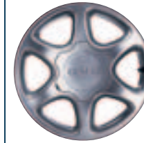
STANDARD 17" PERFORMANCE POLISHED-ALUMINUM.